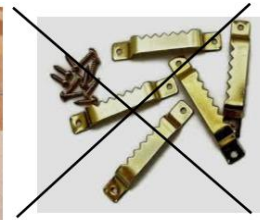
NO SAWTOOTH HANGERS