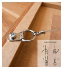
All work MUST be ready to hang with a hanging wire.